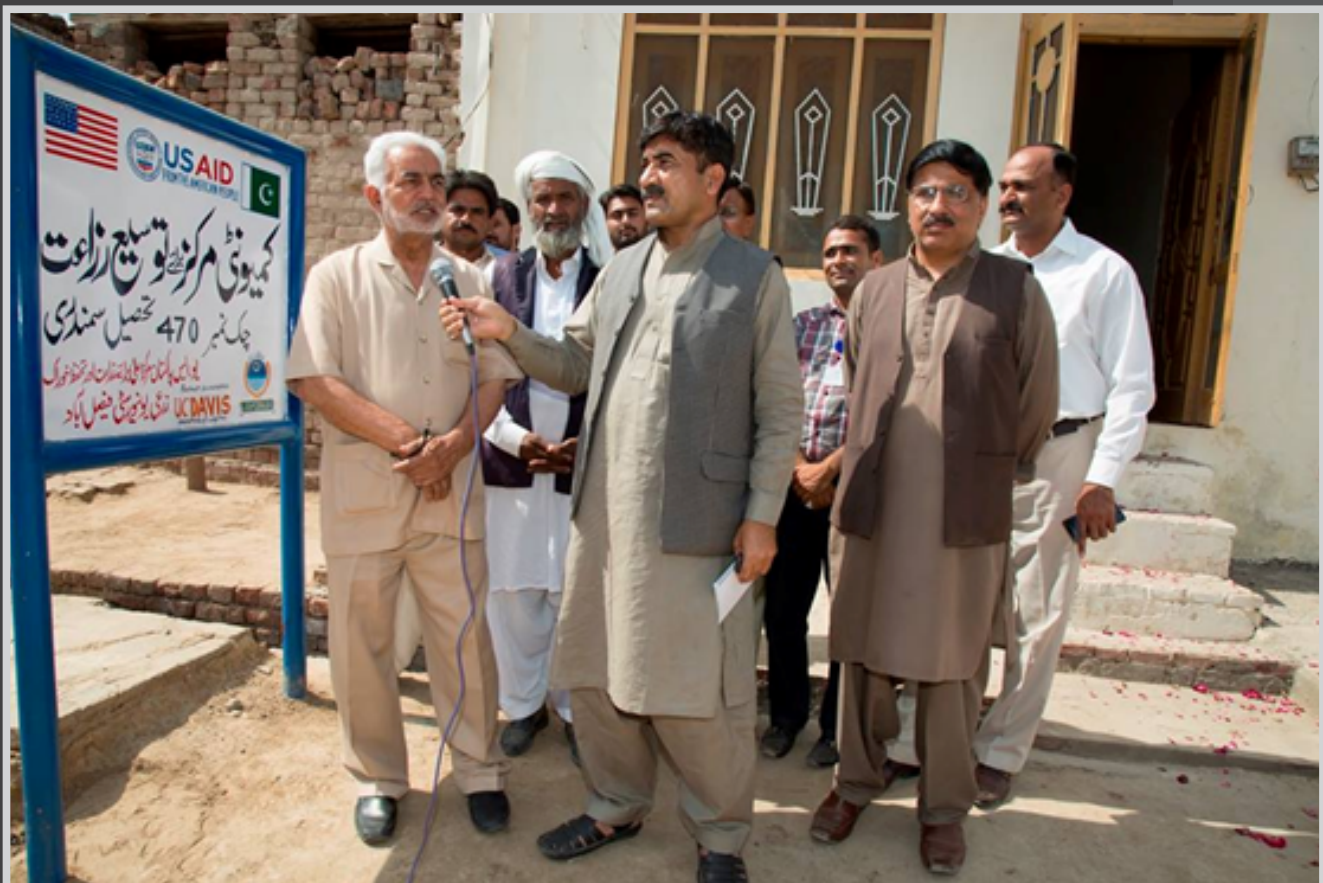
Inauguration of Community Outreach in Samundri.