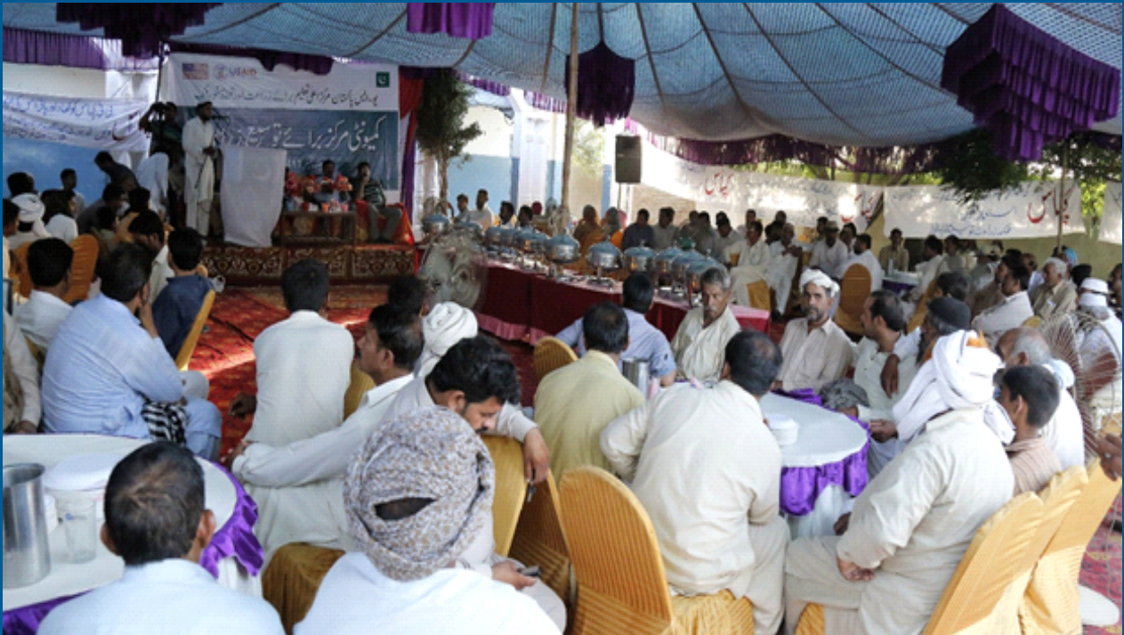
Community Meeting in Tandlianwala, District Faisalabad