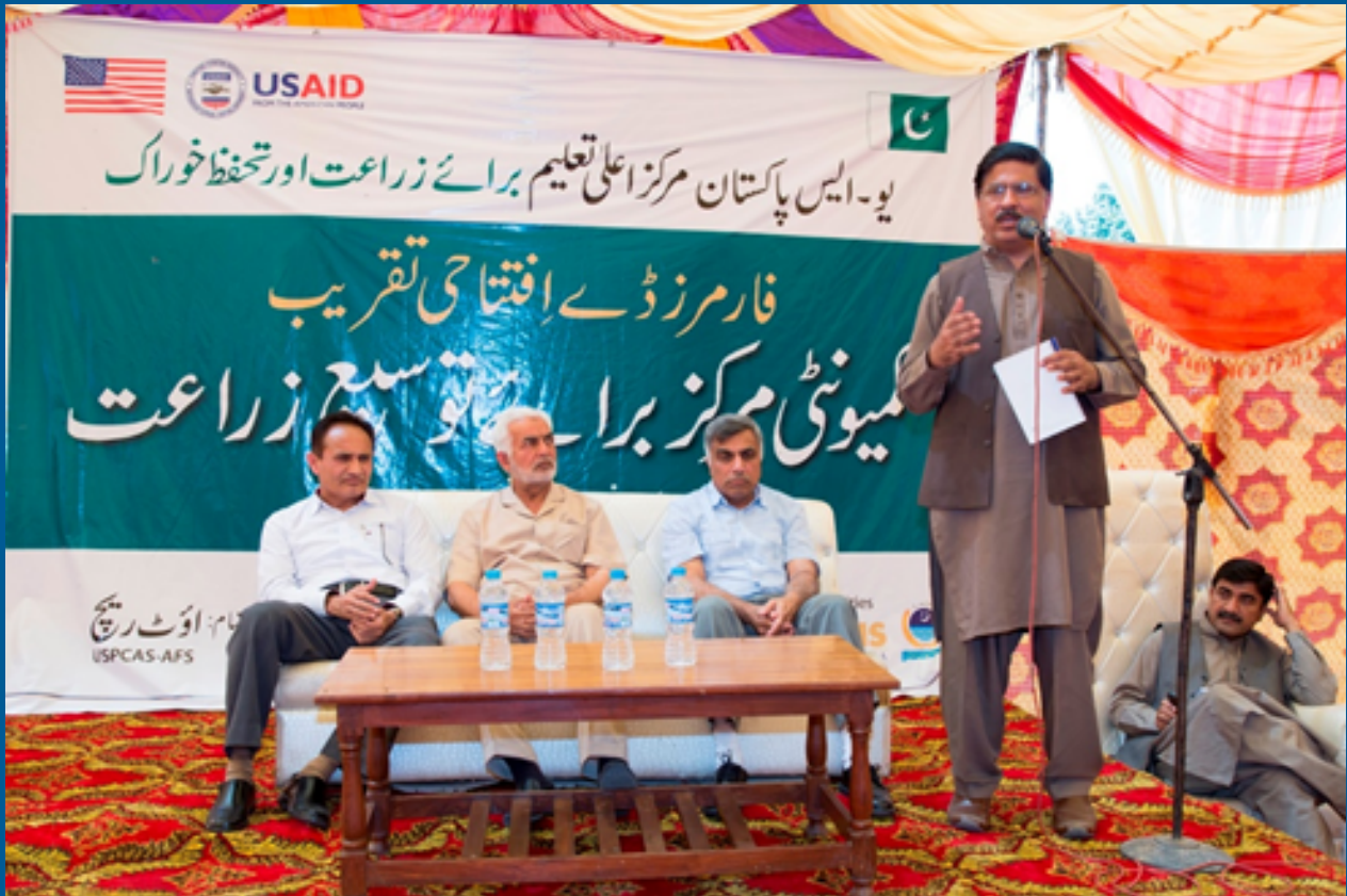
Farmers' Day in Samundri